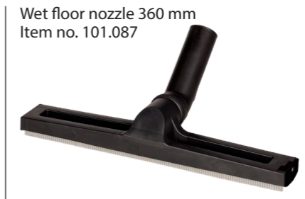
Wet floor nozzle 360 mm Item no. 101.087