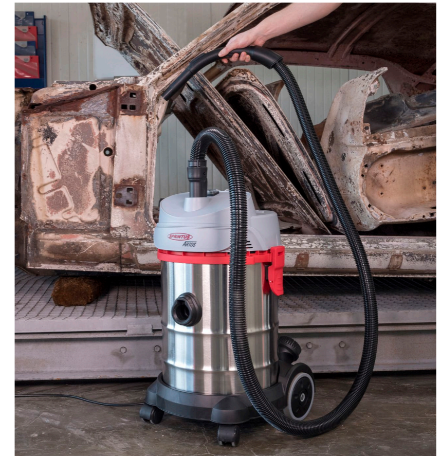
The blower function is integrated on the top of the appliance and is activated simply by attaching the vacuum hose.

the surface to be cleaned. The 360 mm wide floor nozzle included in the basic configuration is extremely user-friendly and can be converted from a wet floor nozzle to a dry floor nozzle by simply exchanging the rubber strips for brush strips. High-quality components, such as the strong stainless-steel container and the 1200 Watt motor, make the Artos a robust and reliable partner in professional cleaning.