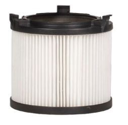
HEPA 13 fine dust filter cartridge Item no. 116.106