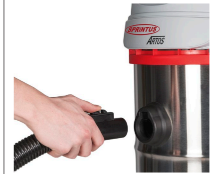
Easy hose click system.