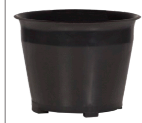
Cyclone unit Item No. 116.105

The illustration shows the patented water separation system with cyclone unit. Item no. 116.105 Due to the twist of the intake nozzle, the spray-fog is consequently diverted along the inner container wall. Additional filters are no longer necessary. The reliable floater system even reacts during heavy foam growth. Cooling air slots located on the side ensure the consistent separation of cooling and processed air.