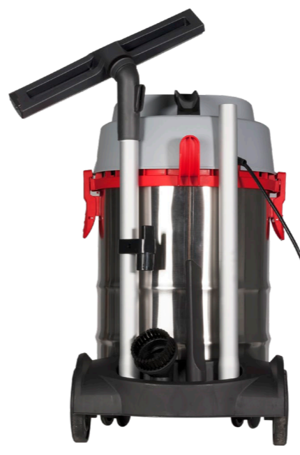
Always close to the action: 4 accessory slots and a park position for attachments on the back of the vacuum.