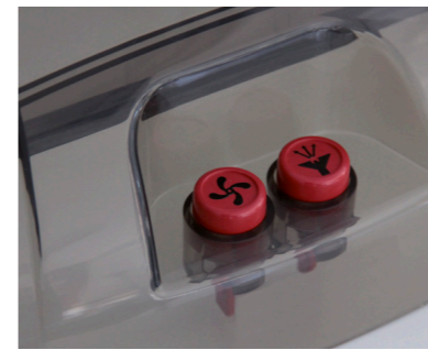
Spray-and vacuum-function are separately switchable at the device.