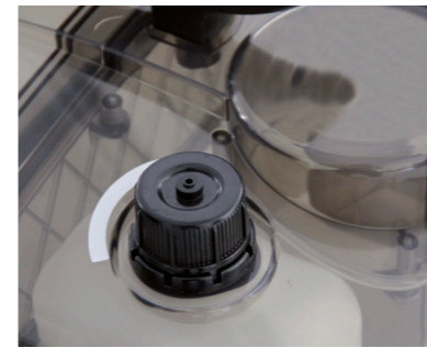
A separate tank allows for the use of anti-foaming agent and guarantees problem-free work.