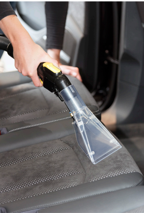
Clear upholstery nozzle for cleaning vehicle seats etc. The spray function can be adjusted via the operating lever on grip.