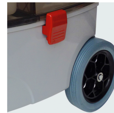
Large rubberwheels for silent running on tiles and mark free running on sensitive surfaces.